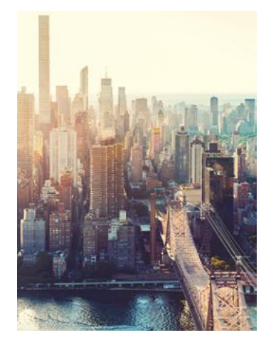
New York City 750 Lexington Avenue, Floor 9, New York, NY 100223