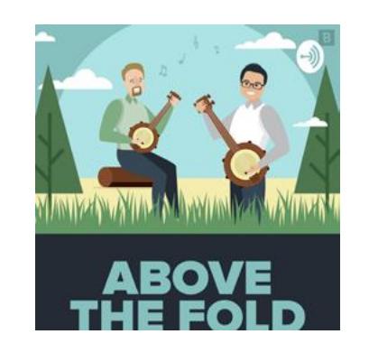
Above the Fold Podcast