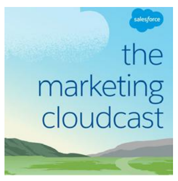
<u>Salesforce - The</u> <u>Marketing Cloudcast</u> Podcast