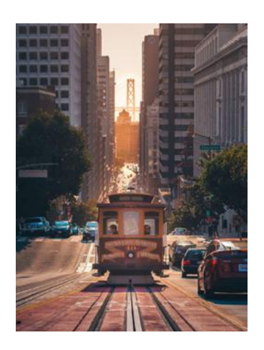
San Francisco 156 2nd Street, San Francisco, CA 94105