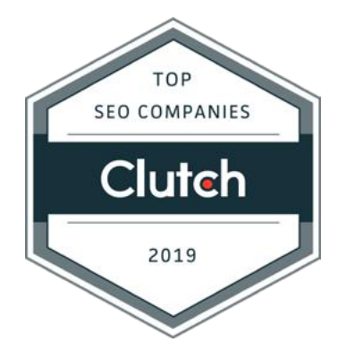
Clutch Best SEO Companies & Services - 2019