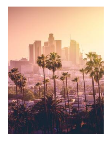
Los Angeles 555 West 5th Street, Floor 35 #306, Los Angeles, CA 90013