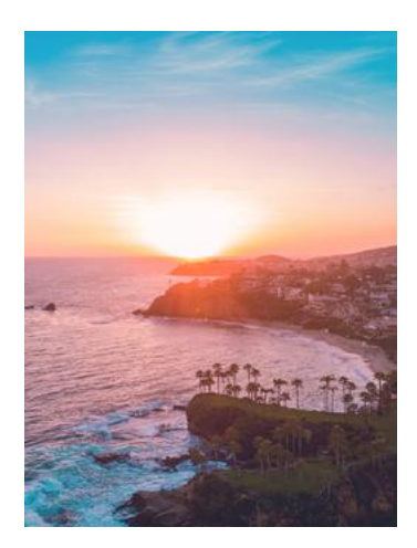
Orange County 5201 California Ave, #150, Irvine, CA 92617

We're here for you, wherever that is in the world.