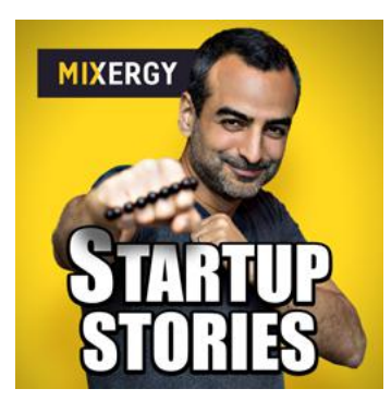
Startup Stories with 1000+ Entrepreneurs and Businesses