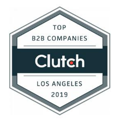
Clutch Top B2B Service Providers in Los Angeles 2019 Marketing and Advertising

Chief Marketer's Top 200 Marketing Agencies - 2019